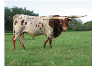
WS SUN RISE