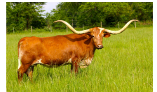
HUNTS COMMAND RESPECT