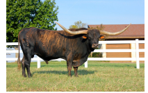
ECR ETERNAL TARI 206