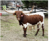
LTL TUFF'S AURORA 742

TTT: 60.8750 on 03/14/2023 Right Base: 11.0000 on 06/16/2021 Left Base: 10.5000 on 06/16/2021