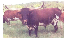
SAGE SUE BL915